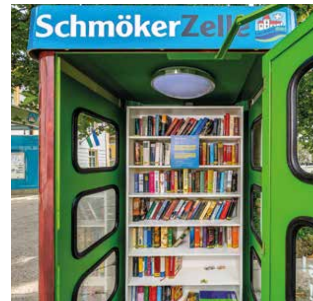
“Schmöker-Zelle” is a bookworm’s dream – grab a book there!

The town’s free library box right outside the town hall is well frequented. Every day, up to 20 book lovers pay a visit to the converted telephone booth to find fascinating, free literature. Anybody can take one or more books home and return them after reading – and add their own books as well. And if you are looking for something more specific, a good place to start is the public library on Marktplatz, where bookworms and avid readers have a choice of more than 6,000 works.