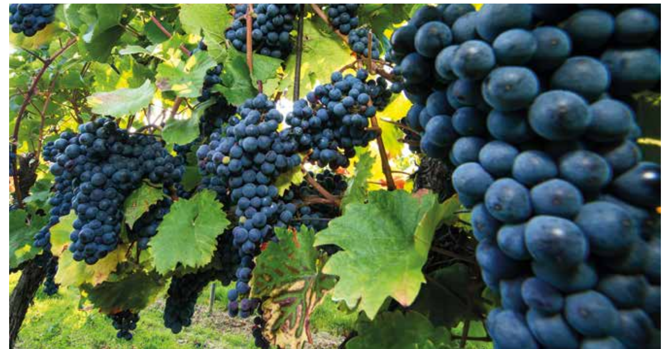
Leobersdorf without viniculture is unimaginable.

Winemaking has a long tradition in Leobersdorf. The town's two local hills, the Lindenberg and Sollenauer Berg, were probably planted with cultivated grape vines as far back as pre-Roman times. The Untere Setz has also developed into a viticultural region – and Leobersdorf into a winemaking community.