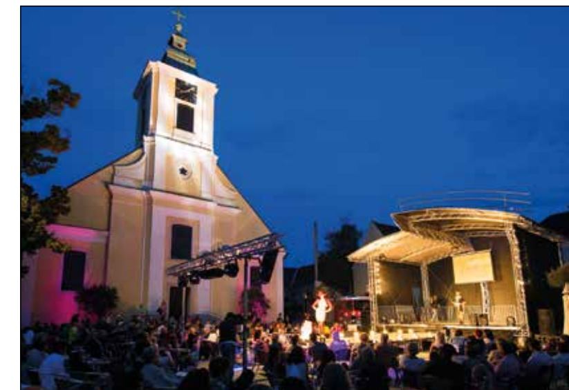
...Nowadays, it is the ideal place for events.