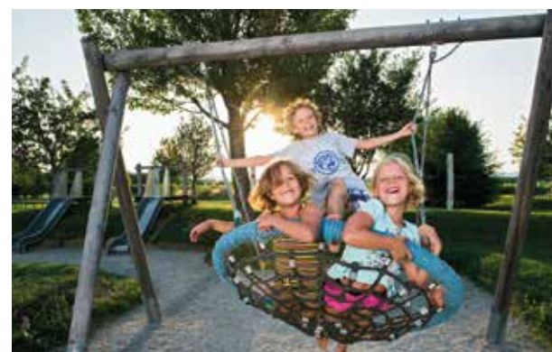
Leobersdorf's "Generations Park" – a paradise for young and old!

bewegungs.reich Leobersdorf comprises nine precisely measured routes in and around Leobersdorf with kilometre marks and signage for walkers, runners, Nordic walkers and hikers. Each individual route follows a loop from Rathausplatz and back again.