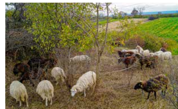
Sheep help protect precious dry grasslands at the Lindenberg.

As part of the Gesunde Gemeinde initiative, the town hosts around 20 health-related and nature events every year, such as cooking with wild herbs or workshops on natural cosmetics. The typical programme also includes nutritional advice and a chance to share experiences.