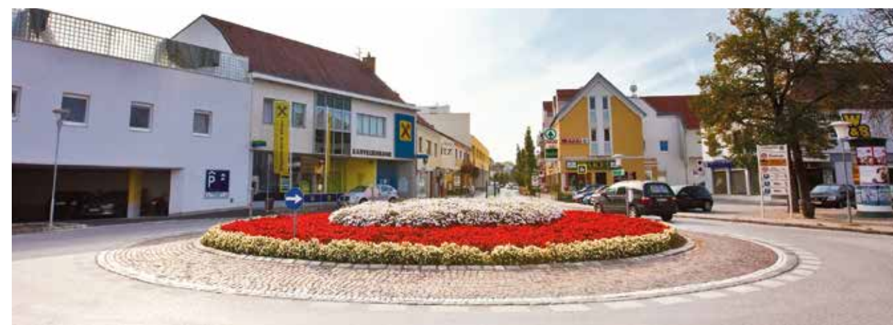
Leobersdorf's streets flourish in all colours.

Leobersdorf has committed to using entirely chemical-free, environmentally friendly weed-killing methods. A specially designed vehicle sprays weeds with 140°C steam. This process triggers a protein shock in the weeds that destroys the plant's cell walls. This toxin-free weed-control method is also safe for bees and other insects.