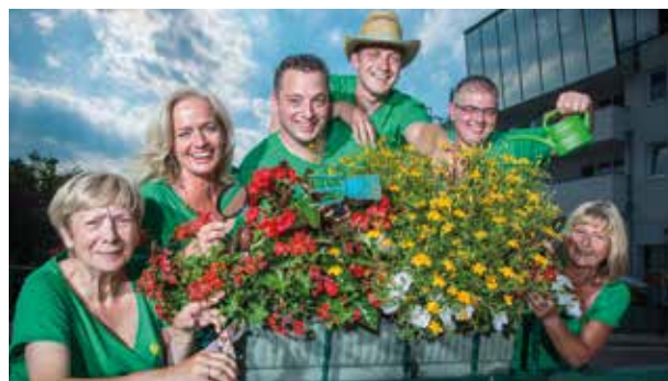
The voluntary club of village beautification creates a radiant city center.

From the dog club to the choir to the tennis club – more than 50 associations make for a vibrant community scene in Leobersdorf. In the hot summer months, for example, the village beautification association waters dozens of flower beds all over the town. And more than 170 guides and scouts cultivate their love of nature and a responsible relationship with their environment.