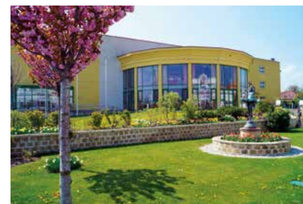
Everywhere in the city impressive green spaces can be found.

Leobersdorf's roundabouts are planted to reflect the seasons. They change their floral look several times a year, acting as eye-catchers for both visitors and Leobersdorf residents. The flower beds are maintained by a nursery, while watering on hot days is handled by municipal workers and volunteers from the town beautification association.