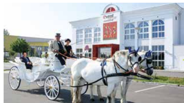
Wedding dreams come true in Leobersdorf's Eventcenter.

With seating for up to 500 guests, the Leobersdorf Event Centre provides a magnificent setting for weddings, celebrations and corporate events.