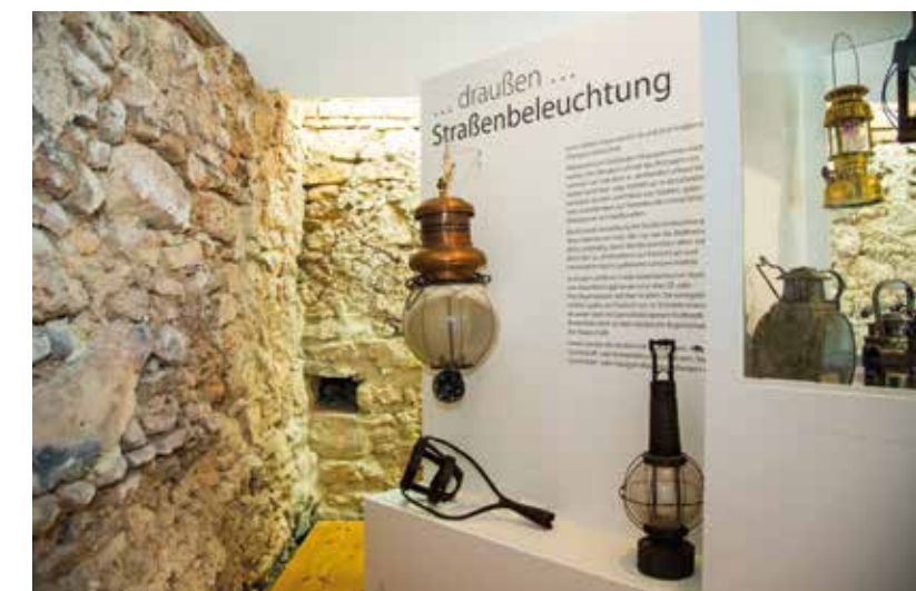
The Museums of Light LEUM is unique in Austria.

ubiquitous modern-day LEDs. The interactive museum features many eye-catching exhibits on Leobersdorf's diverse history and brings to life the work of a cooper – an important profession in a winemaking town.