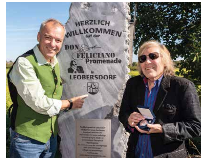
José Feliciano took part in the opening ceremony for his walkway.