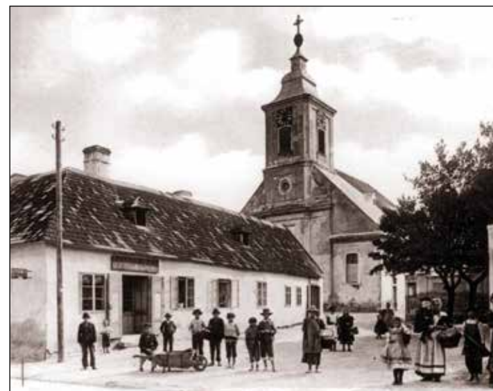
The square in front of the church in former times ...

targeted transformation of the centre into a shared space in 2008 reduced through traffic in the town centre while at the same time enhancing its attractiveness for shops. The project has demonstrably succeeded in reducing through traffic by almost 75%, and the average vehicle speed has been cut by lowering the speed limit to 20 km/h, coupled with construction measures and improved road design. The decrease in private traffic and the added opportunities of running short errands on foot or by bicycle have increased quality of life in the town and significantly reduced emissions. In 2011, the project received the Walk Space Award.