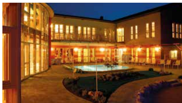
The "WellnessOase" is THE place to relax.

That's what the Leobersdorf WellnessOase spa has to offer. Classic sauna facilities and innovative wellness areas at all temperature levels guarantee a relaxing stay for body, mind and soul. Light therapy, soft music, aroma grottos and exclusive herbal infusions give a new lease of life while providing the ultimate relaxing experience. Cold mist showers, splish-splash systems, an outdoor pool and spacious shower areas offer a variety of options to cool off.