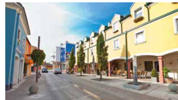
Thanks to a relief road combined with a 20 km/h speed limit in the centre, traffic on Leobersdorf's main street decreased by three quarters.

Opened in 2019, the commuter car park by the Leobersdorf exit from the A2 motorway currently offers 60 parking spaces right next to motorway on-ramps. Once completed, there could be space for as many as 200 vehicles. This makes it even easier for commuters to form carpools for journeys to Vienna or Graz while simultaneously cutting CO 2 emissions.