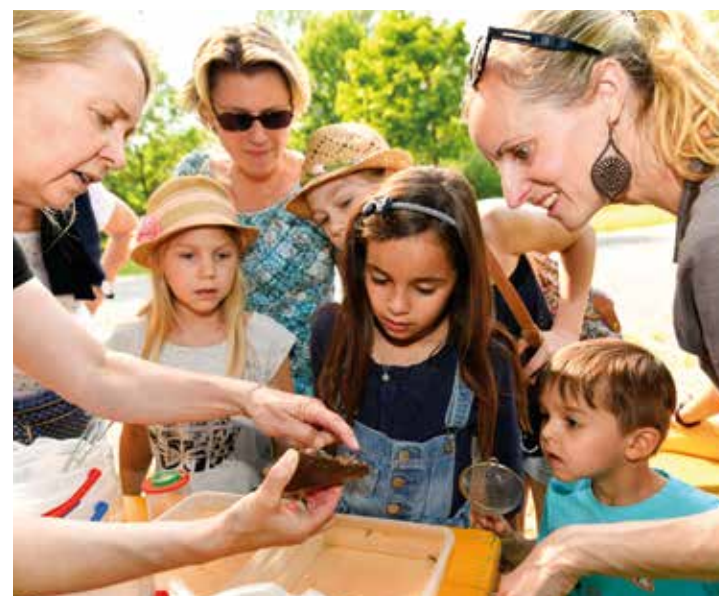
The annual family day provides a lot of nature experiences at the Generations Park.

Leobersdorf primary school has applied for the Umweltzeichen eco-label for education and schools. The Austrian eco-label certifies schools and teacher training colleges that make a strong commitment to protecting the environment, and to sustainable, socially-aware school development. Organic, regional food and health promotion are other important core issues for Umweltzeichen-certified schools.