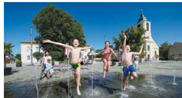
The Town Hall Square offers quite a lot during the hot summer season.

Rathausplatz was created at the end of the 1970s following the removal of a row of houses facing the town hall and the