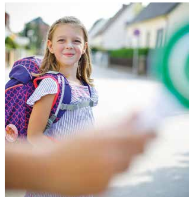
Kids get to school safe with the Pedibus – a pedestrian “bus” guided by adults.

Once a year we clean the town. The local beautification association and the council invite volunteers to help clean roadsides and neighbouring fields. Anything up to 100 hard-working members of the community help Leobersdorf to remove thoughtlessly discarded litter – almost 30 cubic metres of rubbish were collected in 2019.