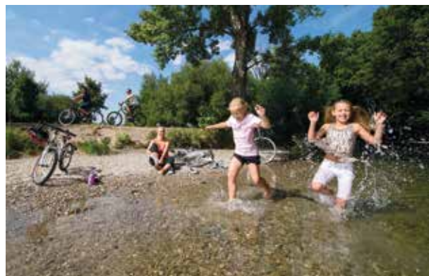
A popular place for relaxation: the Triesting river.

Leobersdorf is situated at the edge of the lush Triestingtal valley, and the picturesque River Triesting runs through the town. Around 60 kilometres long, the Triesting's source is in the Kaumberg region and it flows into the Danube by Schwechat. Flowing through Leobersdorf for 2.4 kilometres, the river provides a habitat for a variety of wildlife. In the future, we aim to prevent devastating floods such as those in 2002 and 1998, which is why the council, as a member of the Triesting Water Board, is working intensively on flood protection measures in the town.