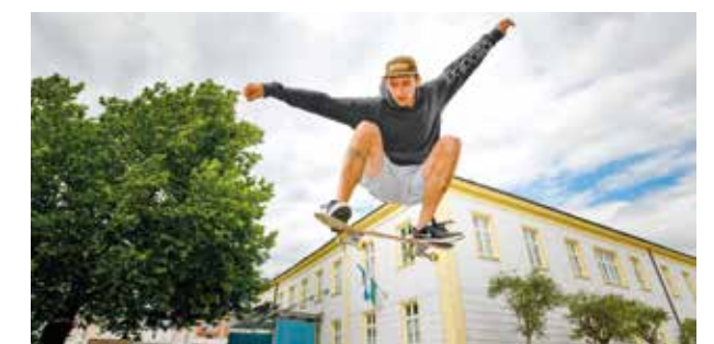
Supporting teens: the youth work TANDEM offers information and company when needed.

Since autumn 2018, there has been a new meeting place for young people in Leobersdorf: the covered pavilion behind the Security Centre was built by young people for young people. In addition to the youth centre on Alleegasse, the Tandem mobile youth work group is on the road all year round at many other locations in Leobersdorf. Young people aged 12 and over can contact the group about any issues they have.