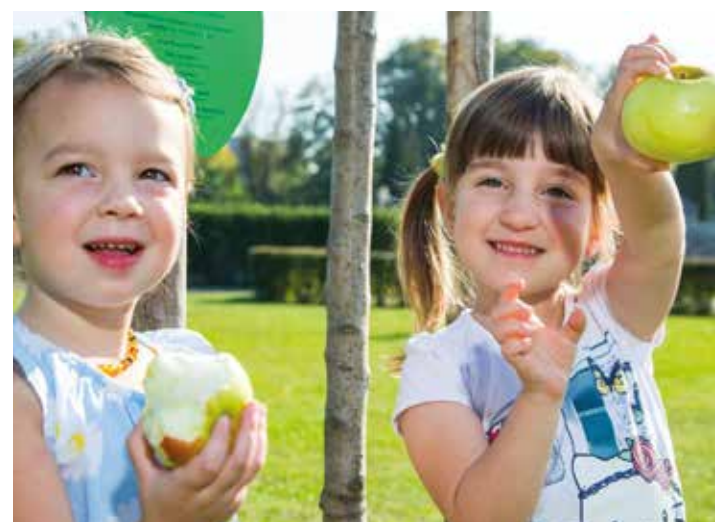
Eat Leobersdorf: Enjoy fresh fruits from public trees!

Having a quick snack is not only permitted, but explicitly encouraged thanks to the Essbares Leobersdorf ('Edible Leobersdorf') project. In public places such as parks and in planters, the town has planted fruit trees, berries and fruit bushes which residents can nibble from. In front of the town hall there are six 'herb barrels' – converted oak barrels, freshly planted with all kinds of kitchen and medicinal herbs. Whether it's oregano for your pizza or mint for your cocktail, you can pick all this and more anytime you like.