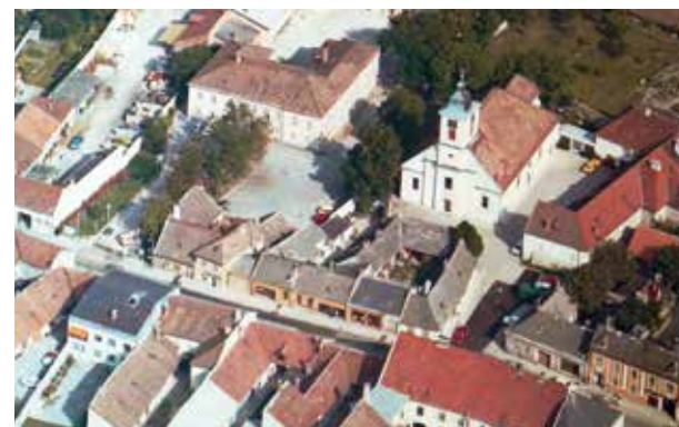
The spacious Town Hall Square in the city centre did not always exist.

Retail Structure Survey commissioned by the Chamber of Commerce and the province of Lower Austria. The study highlighted the overall design concept for Hauptstrasse and Rathausplatz, citing Leobersdorf as a textbook example of an outstanding town centre design which enhances quality for visitors. The town centre was awarded an overall grade of 1.4 for its modern design and landscaping. And there is plenty of parking in the town centre, with more than 300 spaces, while the town's signage system is a model for visitor orientation.