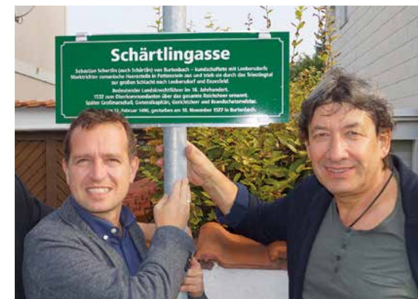
Simple street names turned into reminders of Leobersdorf's past.

Where did Schärtlinggasse or the Nowak-Mühle mill get their names from? Anyone who has ever wondered about these questions might find the answers on their next walk: the town has compiled the stories behind Leobersdorf's street names and buildings, recounting them on information plaques which have been installed on about 50 streets and 40 buildings. Their aim is to bring the stories about their namesakes to life.