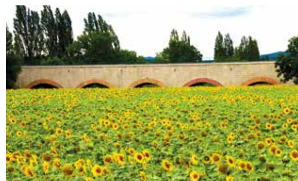
Vienna is supplied from the 1st Vienna Water Pipeline.

The 90-kilometre first Vienna mountain spring water transmission line, running from Kaiserbrunn an der Rax to the Austrian capital, crosses the Leobersdorf municipal area for about five kilometres. Two aqueducts with around 22 brick arches dominate the landscape in the town. Today it delivers 62 million cubic metres of water per year to the city, accounting for 44% of Vienna's drinking water supply.