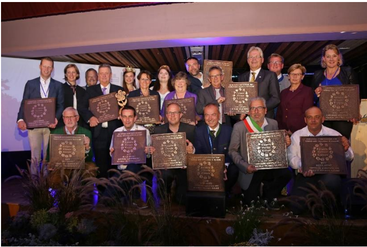
EFE Awards Ceremony 2019 Haus im Ennstal, Austria.

In deciding on the adjudication criteria for the Special Prize, we have taken into consideration Herbert's love of ornamental plants and in particular the use of plants with edible flowers, for medicinal purposes and the value of green space in relation to enhancing public health benefits.