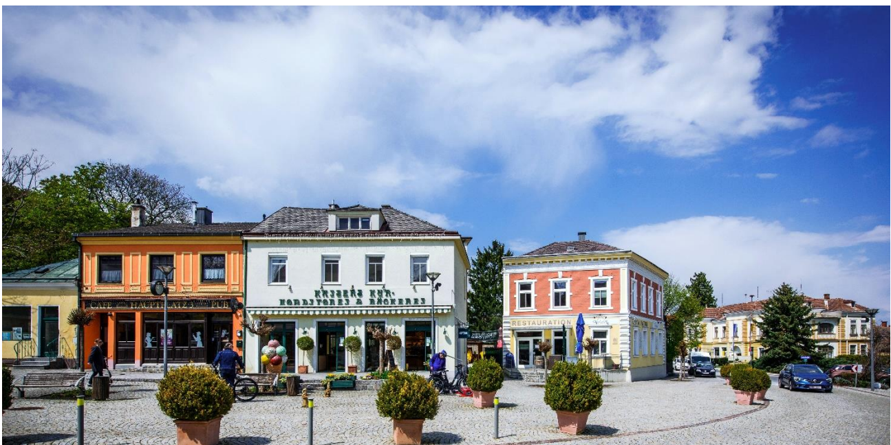
Main Square Bad Sauerbrunn