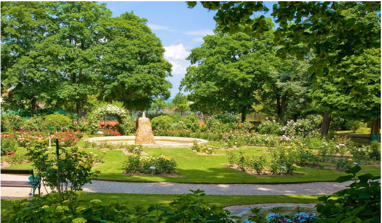
Rosarium, Bad Sauerbrunn

Newly created paths such as the "Sonnenuhrweg" allow tourist to visit highlights such as the observation tower built in 2007 or the historic weather cross, which guarantees great panoramic views high above Bad Sauerbrunn, to be discovered on walks.