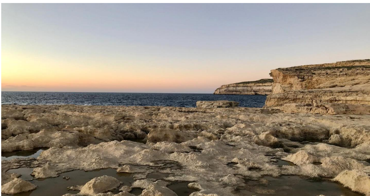
Coastal Landscape, Gozo Island, Malta

Following a successful visit to Malta in November last year, it was planned that our Spring Meeting would take place in Malta in early February 2022. Unfortunately, this was not possible due to the ongoing Omicron crisis. This had nothing to do with any suggestion that Malta itself is not safe. Many people wishing to travel to Malta had to engage in longer journeys involving trains, planes and intermediate stations. This was unfortunately very difficult to organize under the current conditions. The consequence of this is that the national organizations were not in a position to provide insurance cover, for persons undertaking a journey on behalf of Entente Florale Europe. We therefore, ask for understanding that this meeting is now to be held on Zoom on Friday 4 th February 2022.