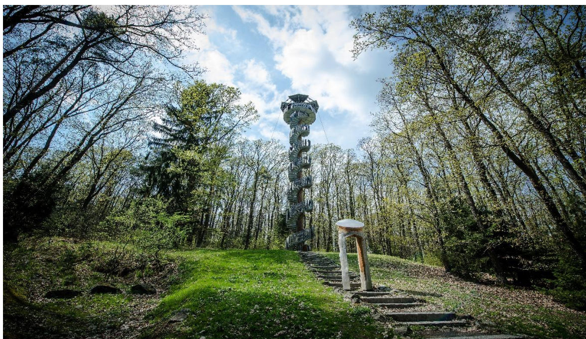
Viewing Tower Bad Sauerbrunn

The traditional spa town of Bad Sauerbrunn is the modern health center of Northern Burgenland and a very special place full of joie de vivre, dynamism and relaxation.