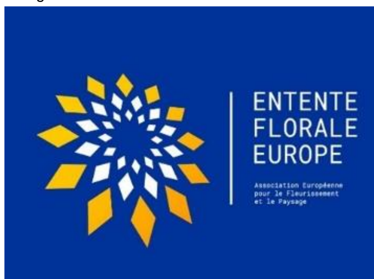
'Official logo of the competition: 'Entente Florale Europe'